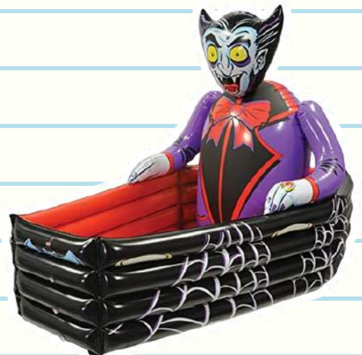
INFLATABLE DRINK COLLER