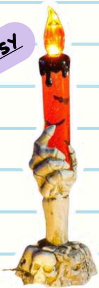
SKELETON CANDLE HOLDER