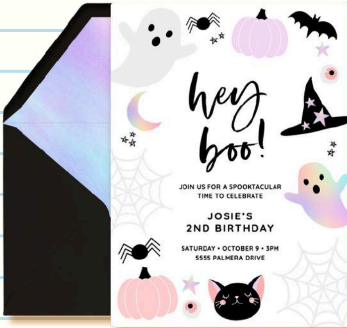
HOLOGRAPHIC HEY BOO