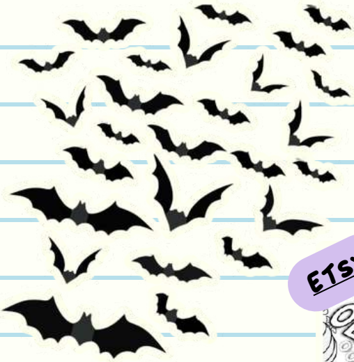
BAT WALL DECOR