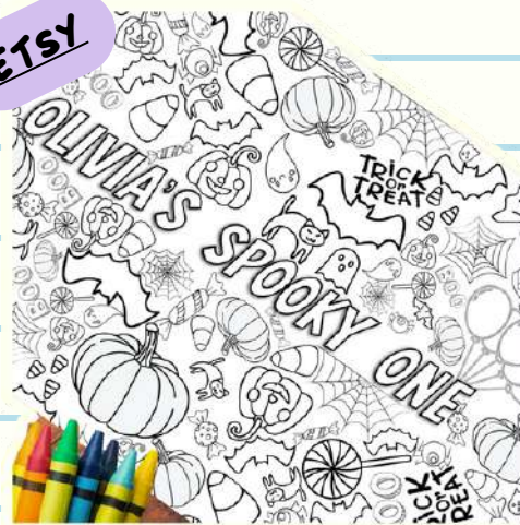
HALLOWEEN COLORING TABLECLOTH