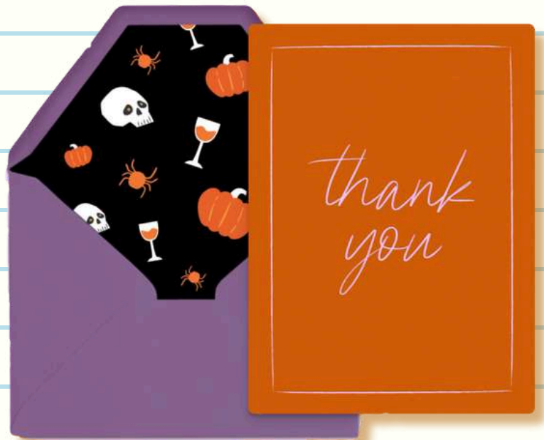
PENCIL WRITING THANK YOU (ORANGE)

FREE ECARD WITH EVERY PURCHASE OF PREMIUM INVITE