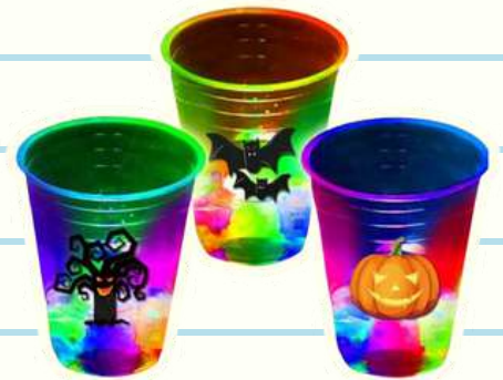
HALLOWEEN GLOW UP CUPS