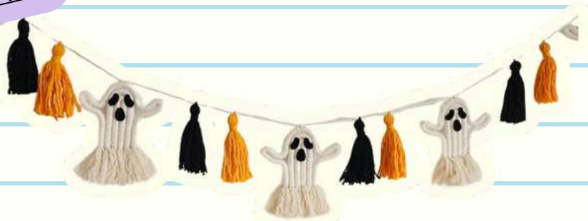
MACRAME HALLOWEEN GARLAND