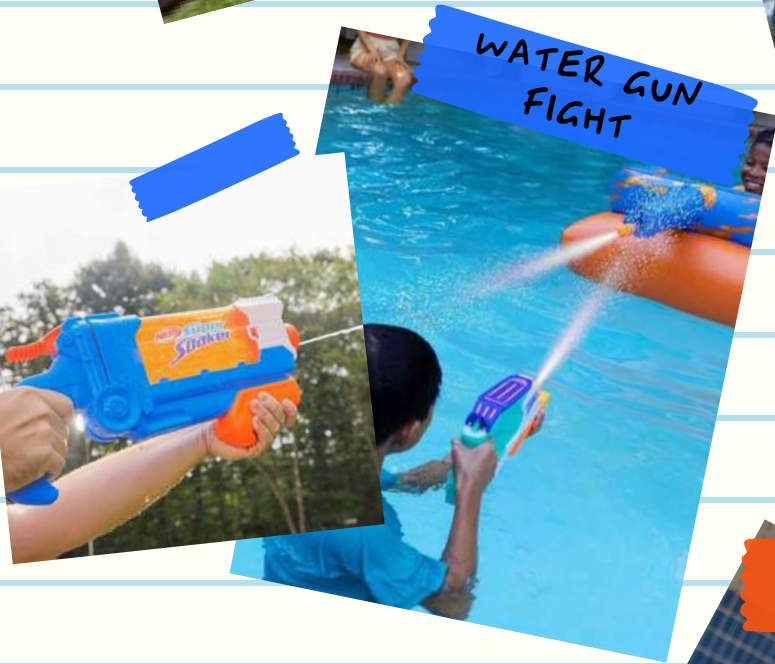
WATER GUN FIGHT