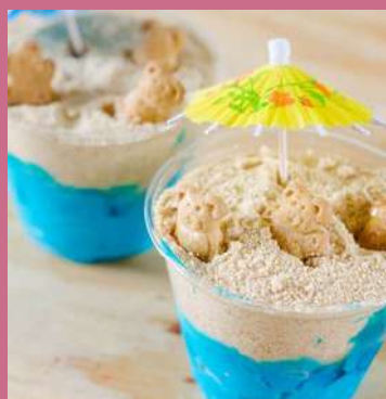
SAND BUCKET CUPS