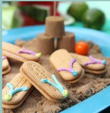
FLIP FLOP COOKIES